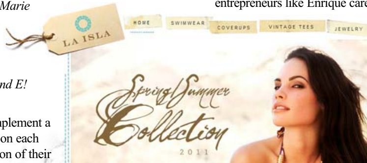
La Isla is a family-owned and operated clothing designer and manufacturer based in Santa Barbara, CA.