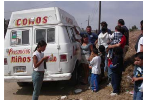
Cornerstone guys buying ice cream, helado, for everyone in the neighborhood.