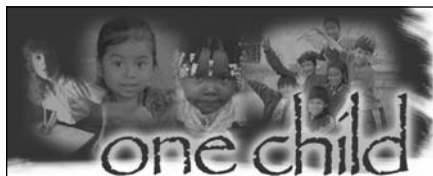
One Child is the quarterly newsletter of Children of The Americas.