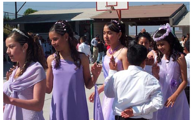
The graduating class in traditional dance and formal attire.

School's out for summer both in Mexico and the States. We were invited to attend the generacion , graduation, ceremonies at Genaro Vasquez school in the colonias. This is the school where we've built a dining room and computer lab, so it was great to see the kids graduate. Six classes, 1st through 6th grade each costumed in themes from traditional Mexican to Polynesian to animal characters to formal for the graduating 6th grade, each did a choreographed dance number as part of the ceremonies. The passing of the colors of the Mexican flag from the 6th to 5th grade was military in its precision and very moving. The kids were beautiful, and we were just glad to be a part of it all.