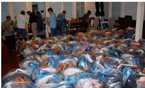
A sea of bagged packs ready for transport.