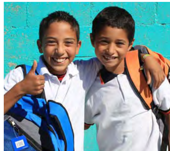
Two ninos, students, at Pedro de Gante school with their new backpacks full of school supplies.

As always, we have scores of people to thank for all this, so take a look at the stories here to