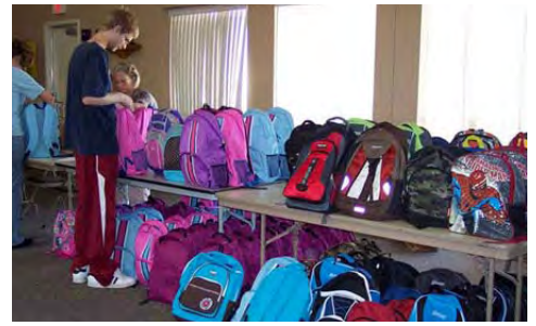
The packs stack up at the NM assembly party.