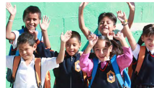
Second graders at Pedro de Gante, showing their appreciation and energy.