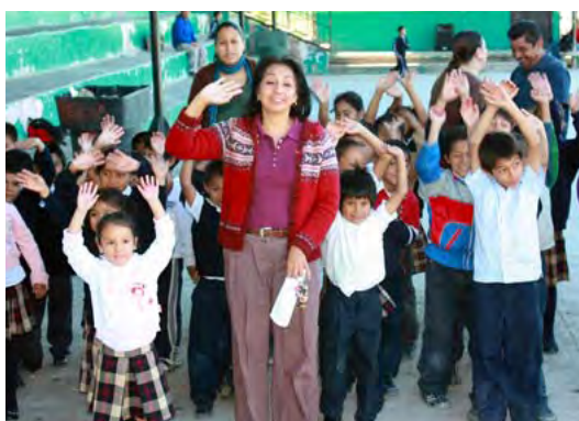
An elementary teacher and her class lining up behind the COTA vans at Genaro Vasquez school.