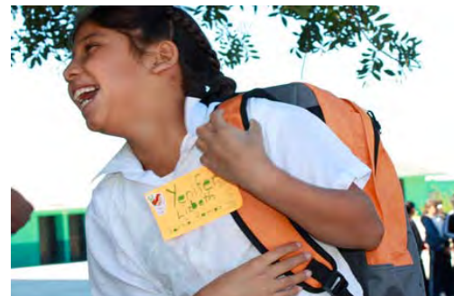
A happy nina with her new pack at Genaro Vasquez.