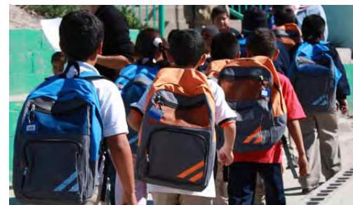
Students filing back to class at Pedro de Gante school in Tecolote with new packs.