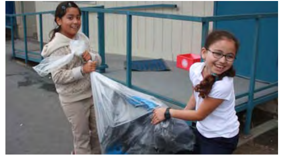
Much more fun than work, we think.