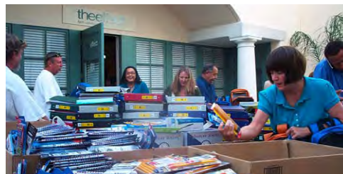
Working through piles of supplies filling packs.

This year's CA backpack assembly party was probably the most organized and well planned yet--or maybe we're just getting really good at this. Working through the afternoon, we were actually finished with set up by 5:30 and by 6PM we had over 30 volunteers with us. We completely assembled and bagged 546 backpacks by 7:30, a new speed record, I think. But that was just day one, we assembled another 100 packs a week later with a second, smaller crew. Take a look... ■