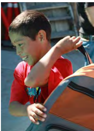
Another nino with his backpack heading home.