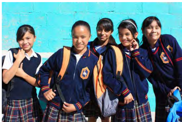
Girls from Pedro de Gante with packs. Uniforms are mandatory in Mexican schools. COTA has helped provide them as needed.