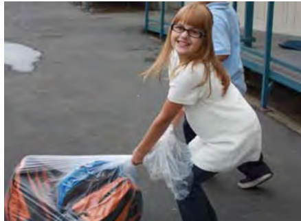
Everyone's helping unload the vans.