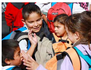
Discussing new packs and day's events.