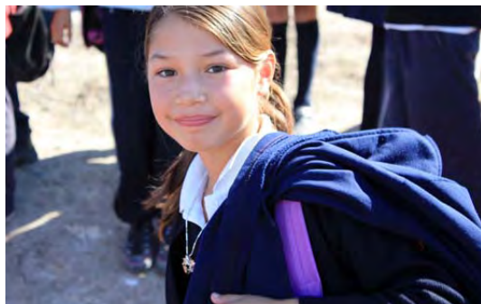
Beautiful middle-schooler with her supplies.