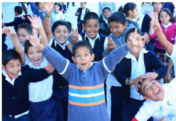
Students at Genaro Vasquez school doing what kids do best--having fun with COTA volunteers with backpacks.

Though we do everything from construction projects to health and hygiene assistance, the primary mission of Children of The Americas is to help underserved kids stay in school competitively and get the nutrition they need to enter young adulthood healthy, well-developed, and having the education and marketable skills necessary to end their cycle of poverty. And so our annual backpack and school supply program is also primary in our eyes--and the eyes of these kids, obviously.