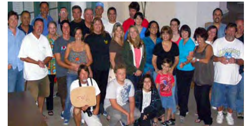
Our 1st crew--or the part left at the bitter end.