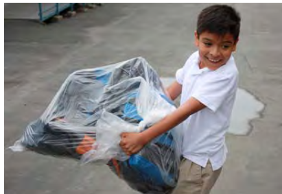
Packs weigh more than he does....