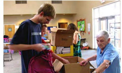
Young and old alike on the assembly line.

four young children received packs for three of their kids through their school. There have also been handwritten notes from students expressing their gratitude for the new supplies and backpacks.