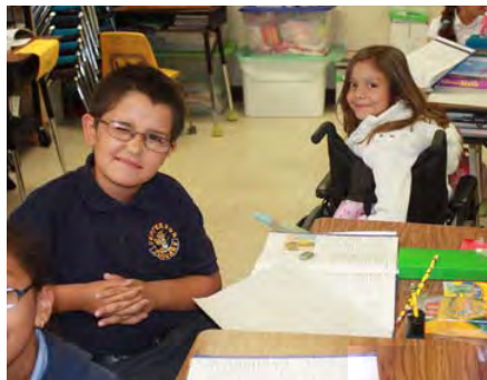
Students at their desks before receiving packs.