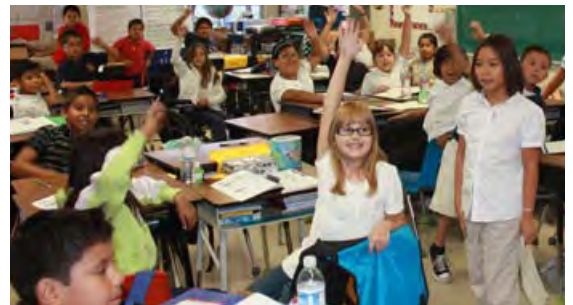
Students were chosen by their teachers based on need to receive packs and other materials.