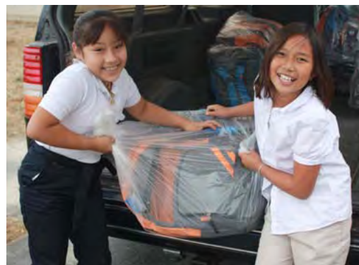
Two middle schoolers at Jefferson Elementary help unload backpacks for the neediest kids.

Two years ago, COTA "adopted" Jefferson Elementary School in a financially underserved area of Santa Ana, CA. Now with CA state budget shortfalls and general economic recession, our help is needed more than ever. COTA delivered nearly 100 backpacks full of supplies and additional school materials for students and their classrooms, some of which was donated by JAKKS Pacific, one of the largest toy distributors in the U.S.